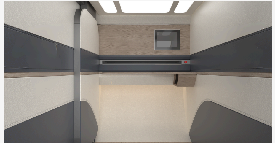
Luxurious Interior with Warm and Reading Lamps

Weight: 850kg (1.5ata), 1250kg (1.99ata)