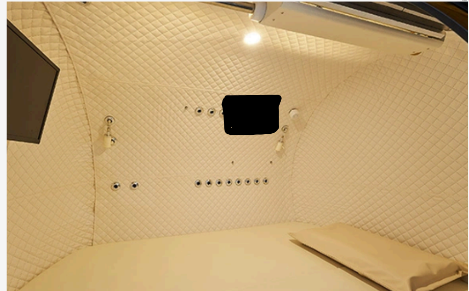
Memory Foam Mattress